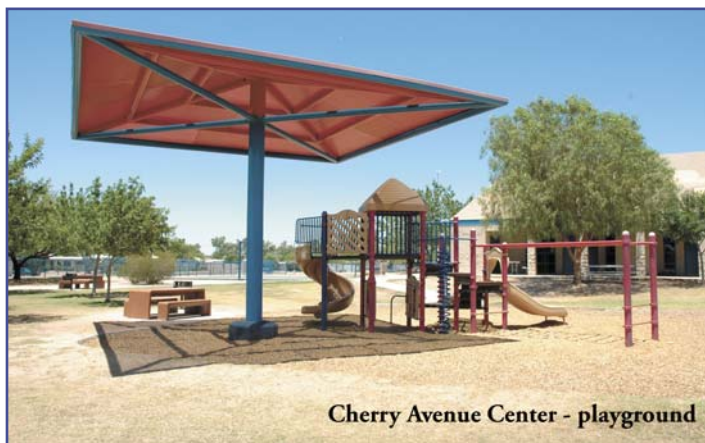
Cherry Avenue Center - playground

Cherry Avenue Park - 6 a.m. to 10:30 p.m. This 2.71-acre neighborhood park, located adjacent to the Cherry Avenue Recreation Center features a grill, play court (1/2 basketball) and playground.