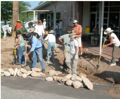
Volunteers hard at work making the Ward 3 Office green!