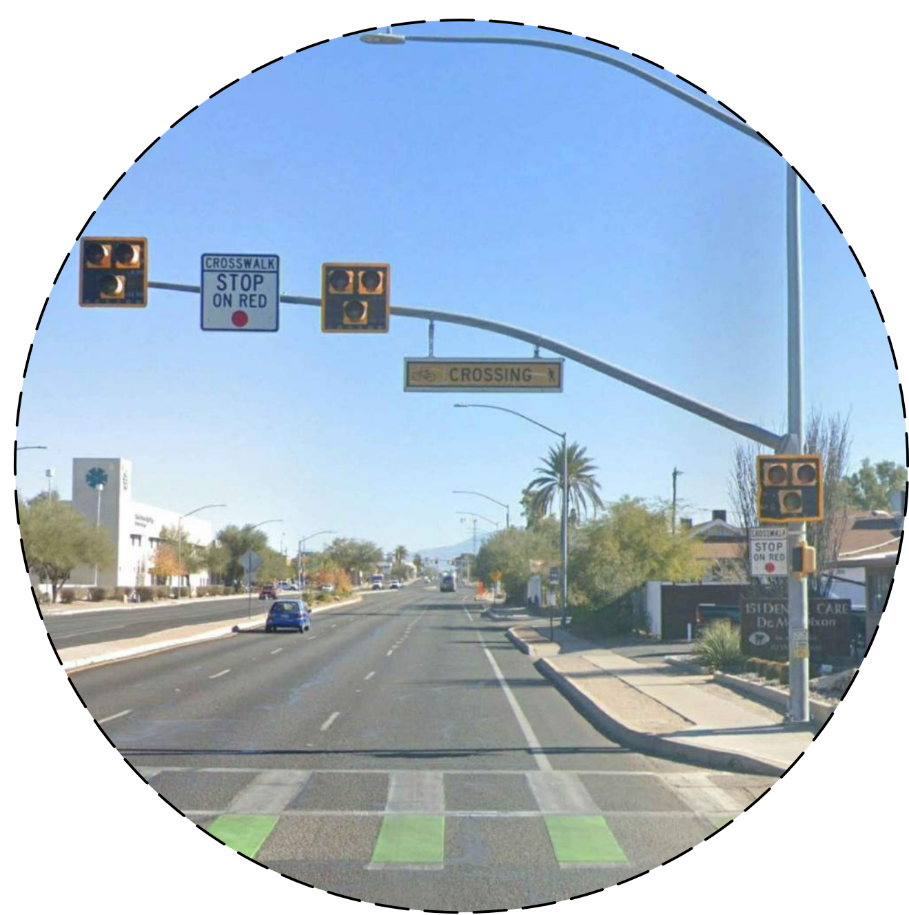
DETAIL A: EXISTING BIKEHAWK CROSSING