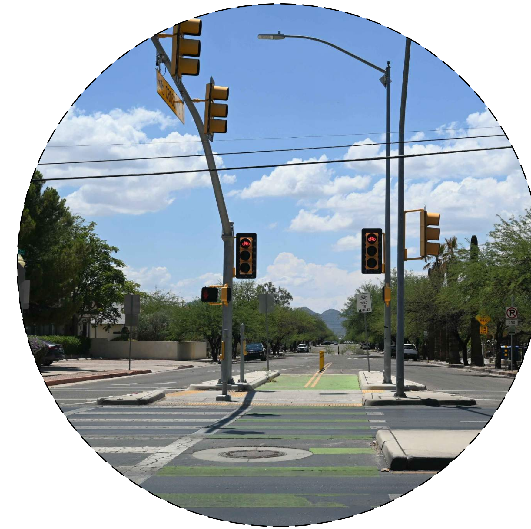
DETAIL A: TOUCAN CROSSING EXAMPLE