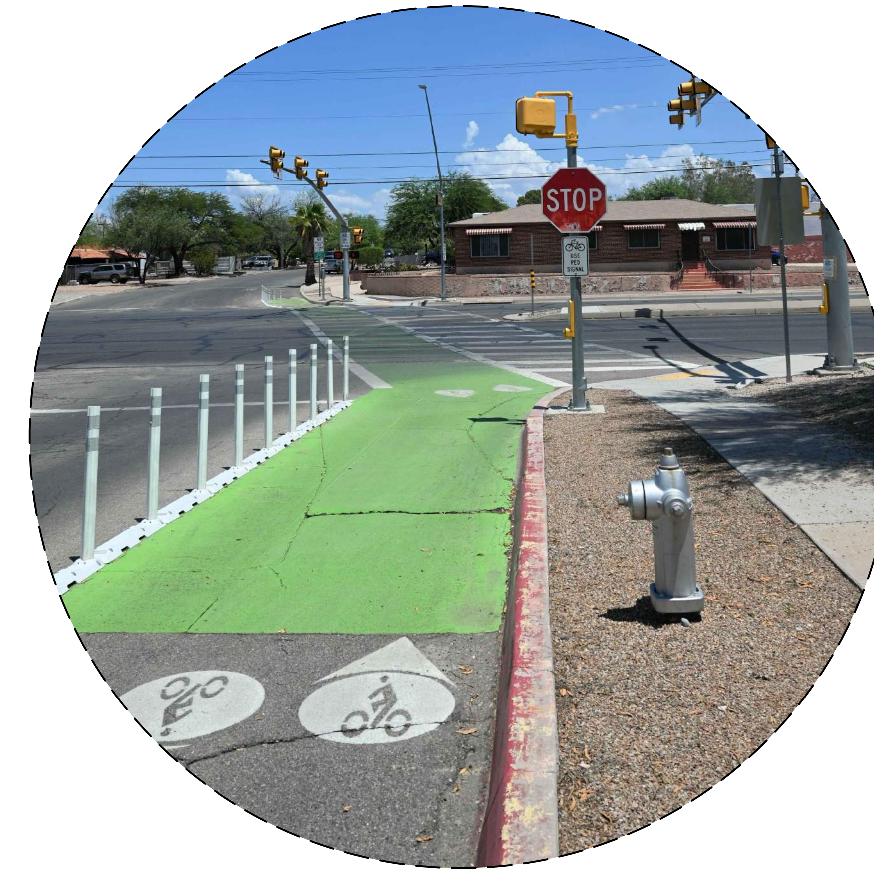
DETAIL B: EXISTING BIKEHAWK CROSSING