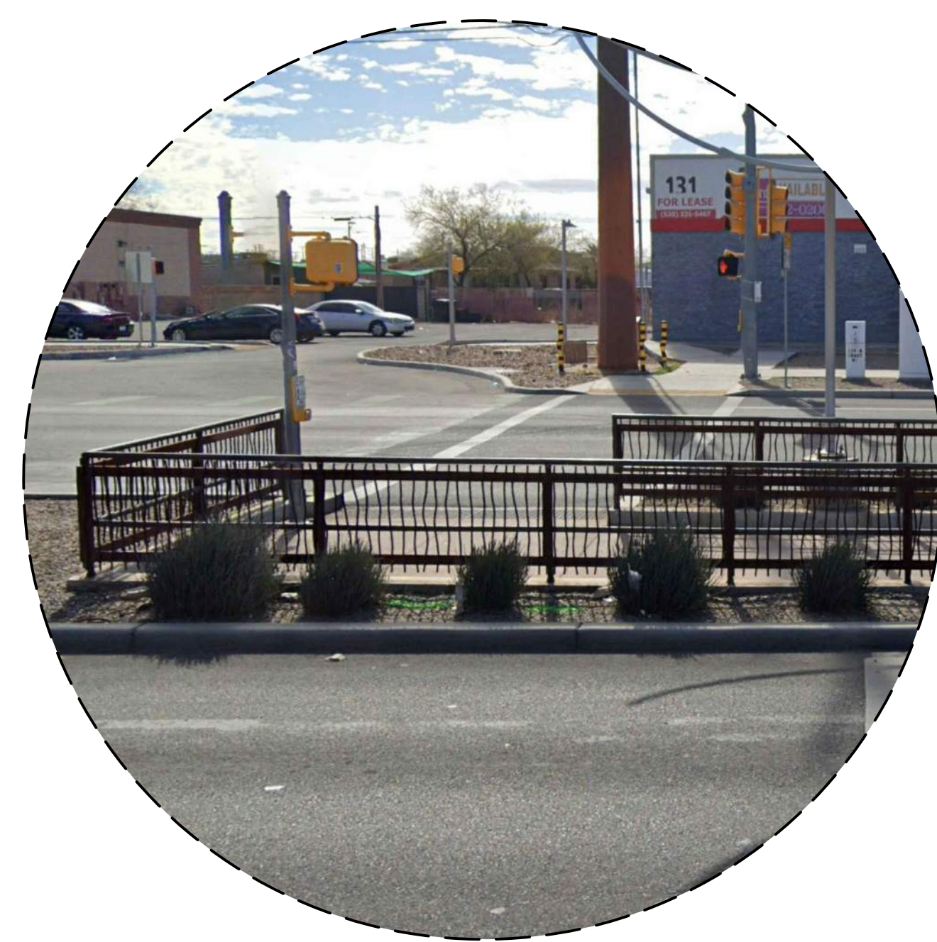
DETAIL B: EXISTING PELICAN CROSSING