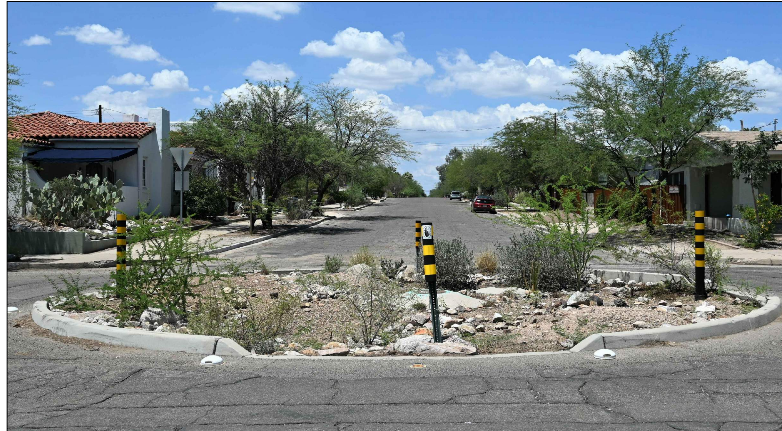
TRAFFIC CIRCLE EXAMPLE