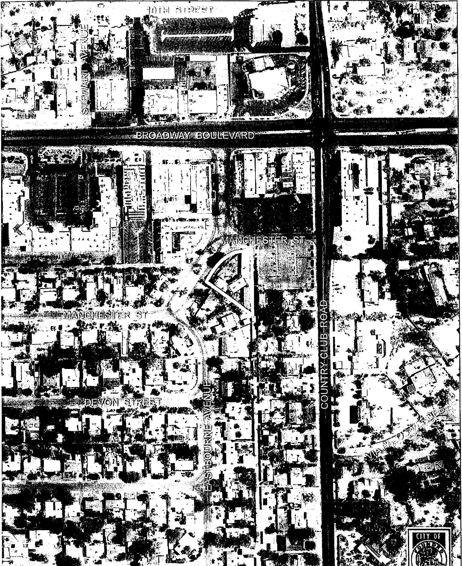
C9-15-02 Broadway Village - Eastbourne Avenue 2014 Aerial