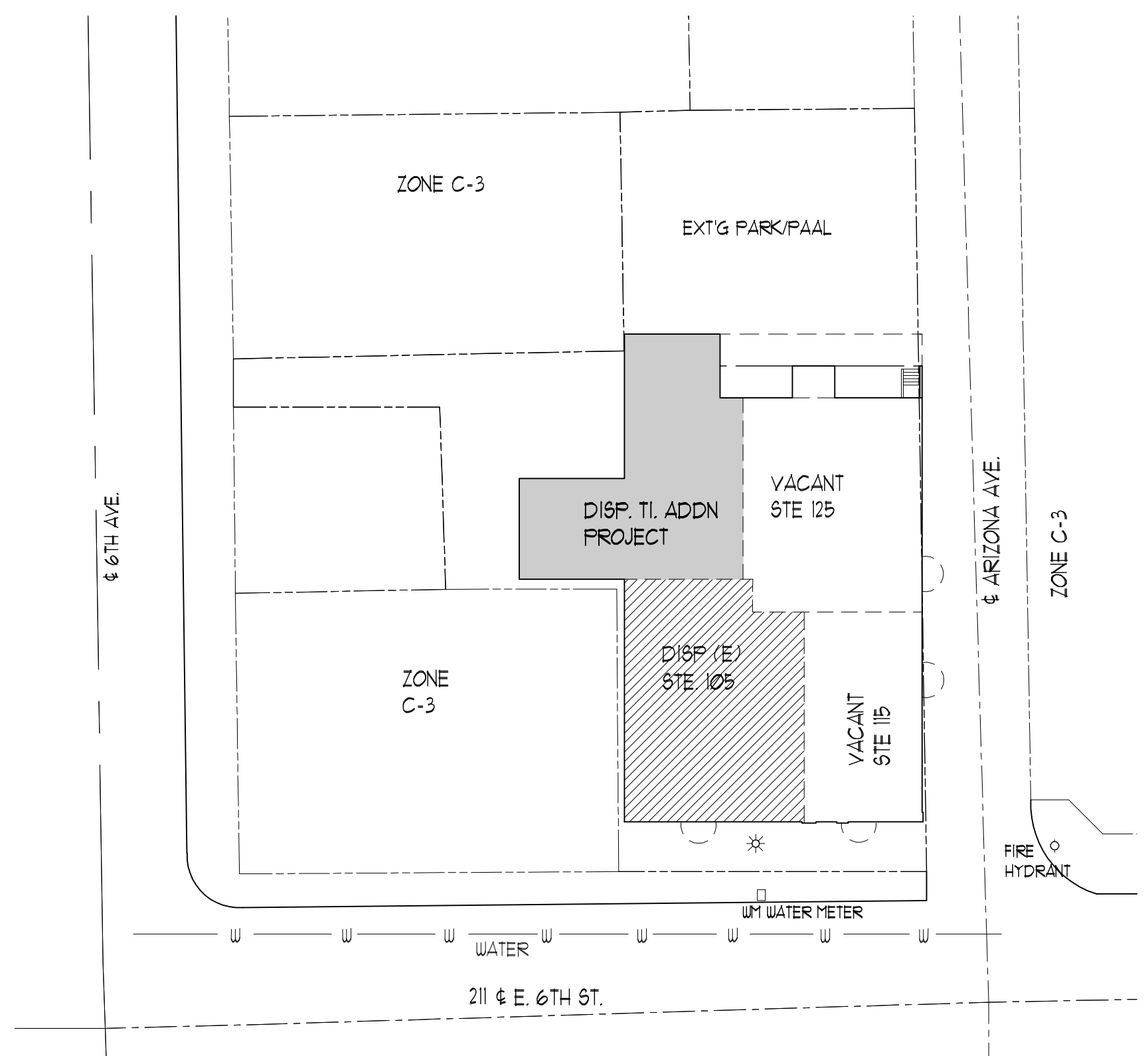
SITE LOCATN PLAN SCALE 1"=50' North

LEGAL DESCRIPTION TUCSON 892.4 LOT 10 & 11 & N57 W2 LOT 10 EXC 947 W33.5' THEREOF & E2 LOT 7 BLK 60 SECTION 12 T148 R13E PARCEL 117-04-2710