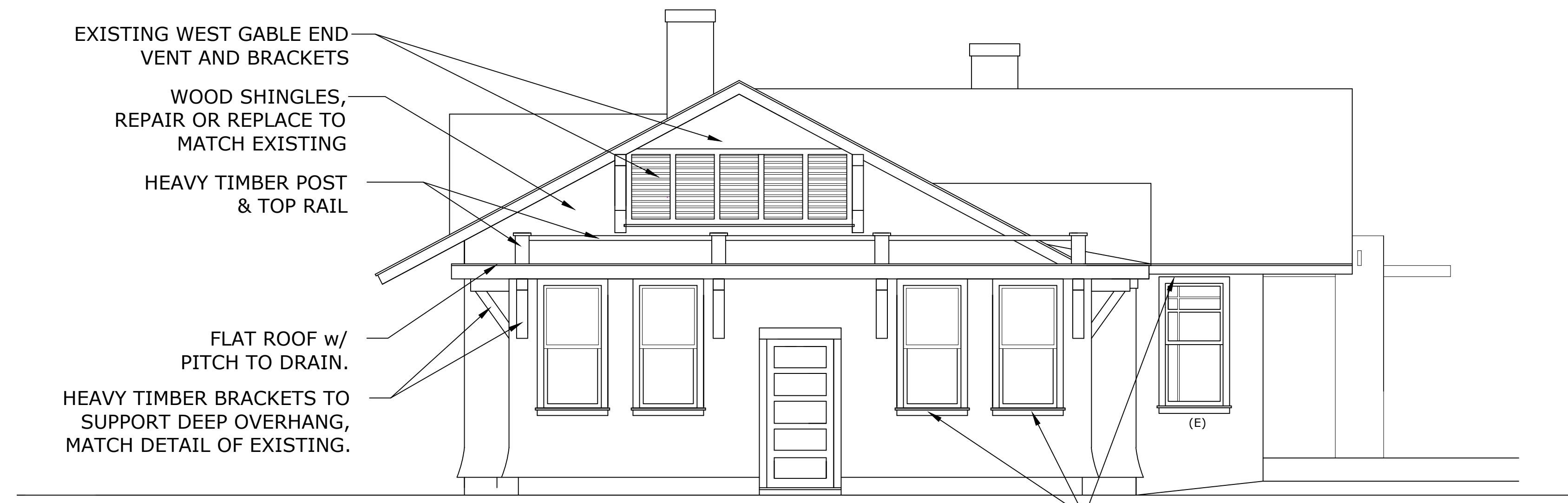
4 SOUTH ELEVATION - DECK & ADDITION SCALE: 3/16"=1'-0"

EXISTING WEST GABLE END VENT AND BRACKETS