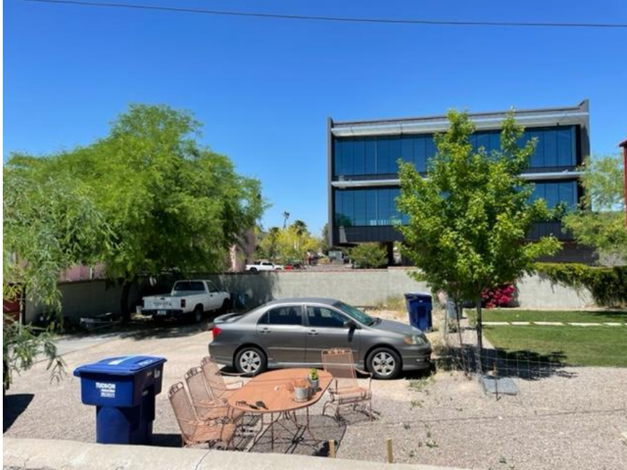
View facing north