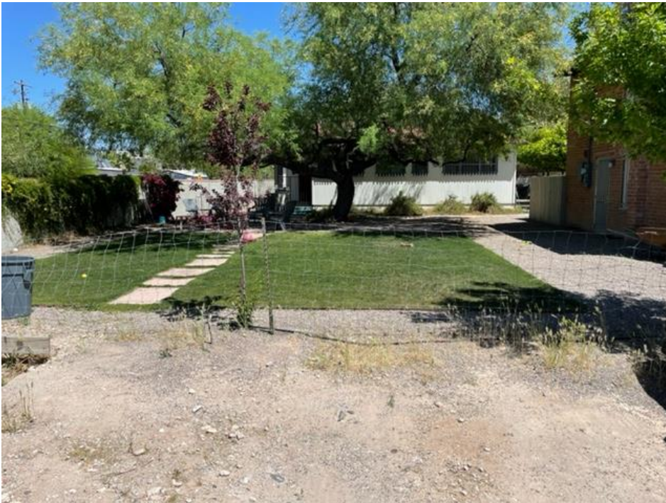
View to main house facing east. Standing on spot of proposed building.