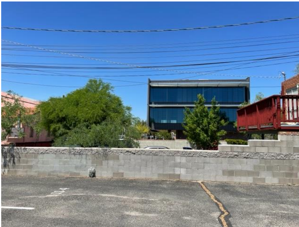
View from adjacent property to the south facing north. Proposed building will be on other side of this wall, but the property drops down extensively behind this wall.