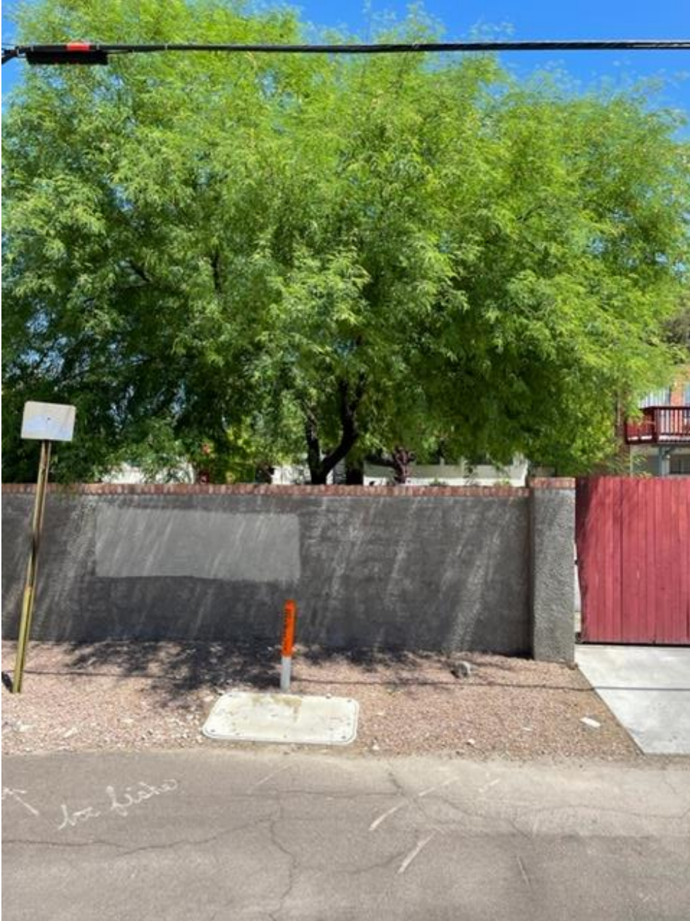
View from church property to the west, looking to the east. Proposed building is behind this wall.