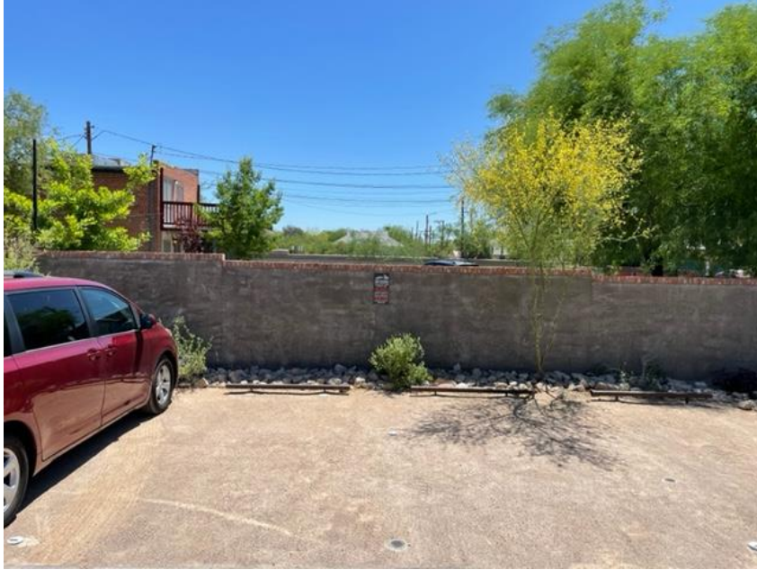
View from north side of adjacent property facing south. Proposed building will be behind this wall