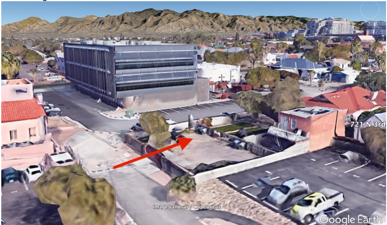
Aerial photo showing location of proposed building.