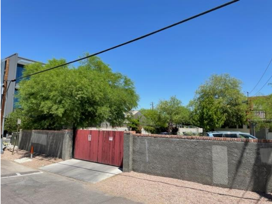
Again, view from church property to the west, looking to the east. Proposed building is behind this wall.