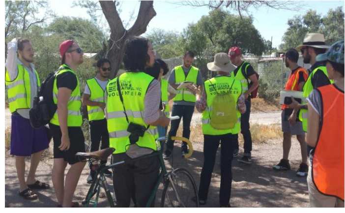
(left) March 28, 2017 – Breaking ground (above) September 2017 – Students help imagine the space