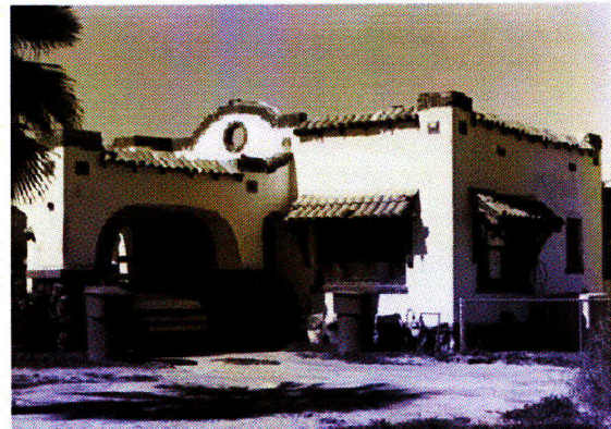
Original photographs accompanying 1992 nomination of Blixt/Avitia House.