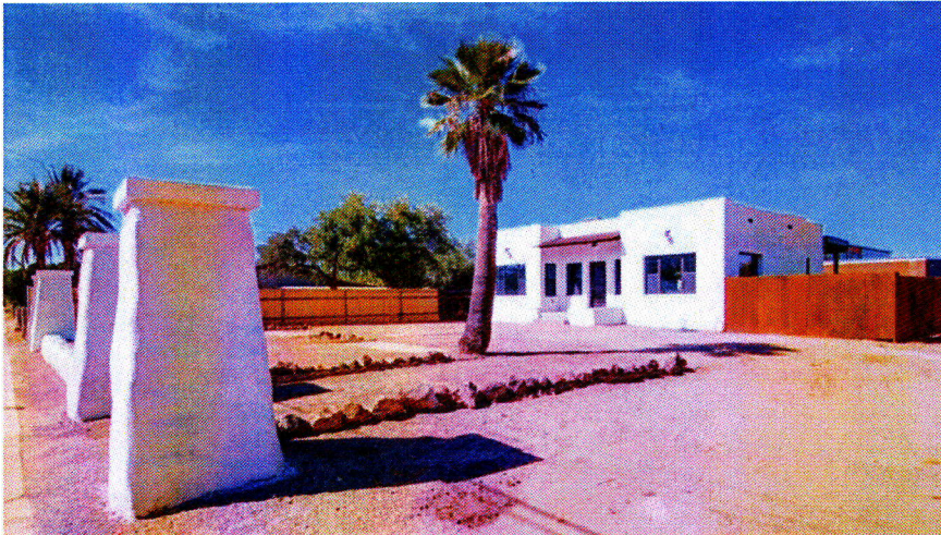
2017 photographs indicating extent of exterior alterations.

The Arizona State Historic Preservation Office requests the Keeper of the National Register to remove the Blixt/Avitia House based on the loss of integrity of its historic architectural features.