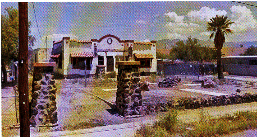
2016 photograph of Blixt/Avitia House prior to major exterior rehabilitation.