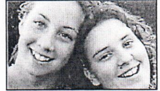
Missing Teens Unsolved For 15 Years, Until Police Uncover The Jaw Dropping Truth...