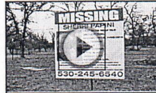
Missing Calif. jogger found alive after 22 days