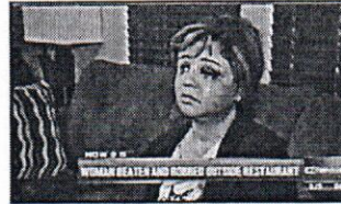
Woman brutally attacked outside Tempe restaurant