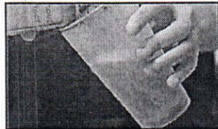
Say No To Frosted Pint Glasses