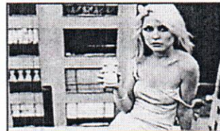
Long Lost Mobster Photos That Will Make Your Skin Crawl