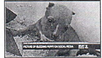
IPD investigating after officer's wife tries to sell bleeding puppy on social media