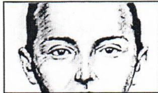
Plane Hijacker Vanishes Without A Trace, Until 50 Years Later...