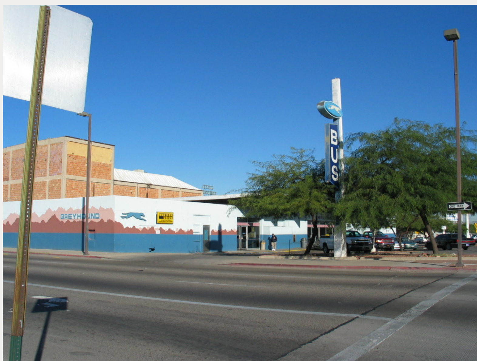
Before: Bus Terminal

Formally a Greyhound Bus Terminal, the block was transformed into a mid-rise apartment complex and several private businesses.