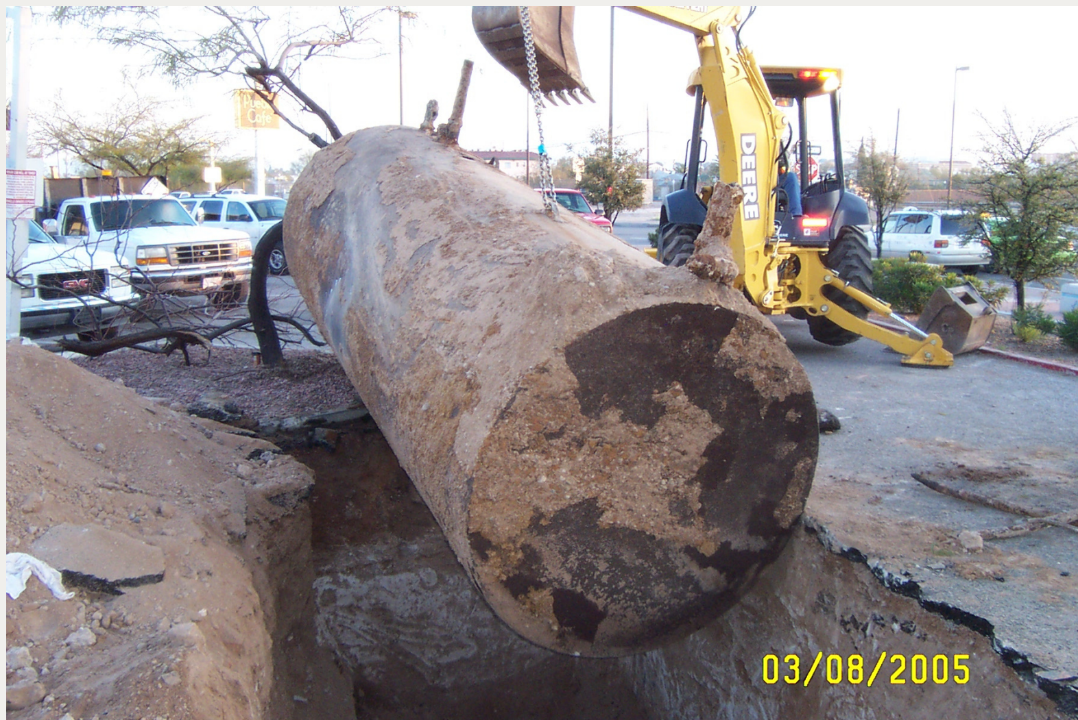
Before: Tank removal

Now a mid-rise apartment building for seniors and people with disabilities.