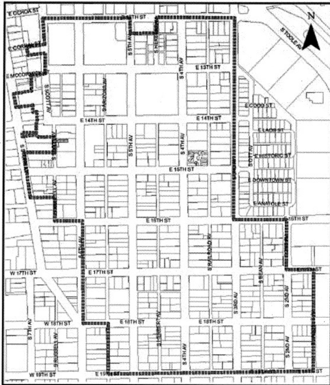
Amory Park Historic District