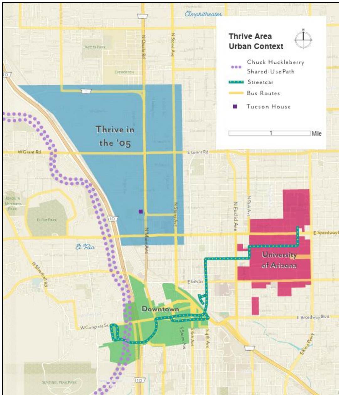
Figure 1: All proposed projects must be within the Thrive in the 05 zone boundaries.

Funding from the grant will enable the complete renovation and preservation of 358 units of affordable housing for older adults at Tucson House (Phase 1), as well as new affordable and mixed-income developments including Sugar Hill on Stone (Phase 2 – 66 units), Amazon Flats (Phase 3 – 59 units), and Stone and Speedway (Phase 4 & 5 – 120+ units). In addition to investments in housing, the CNI grant provides funding for case management and wrap-around services for Tucson House residents.