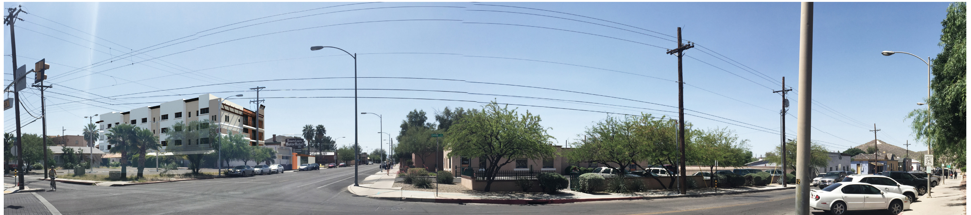
View to South from intersection Stone Avenue / Cushing Street: Barrio Libre Neighborhood to the Southwest of the intersection