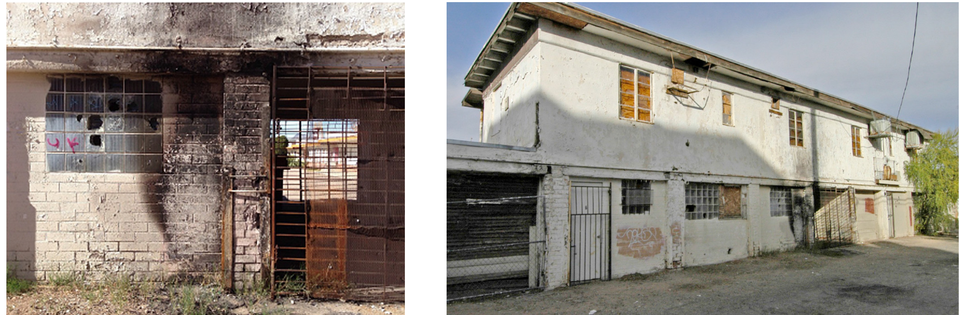
The above images show some of the issues that the building was experiencing: broken windows, decaying walls, and general disrepair.

Since the 1990s, the original Downtown Motor Hotel building has suffered from abandonment and neglect. In 2016, the entire property was redesigned to become the Downtown Motor Apartments. The original Downtown Motor Hotel street-facing buildings have been restored as offices and a community room for the apartment complex. The iconic neon sign has been restored and designated as a “Historic Landmark Sign” by the City of Tucson.