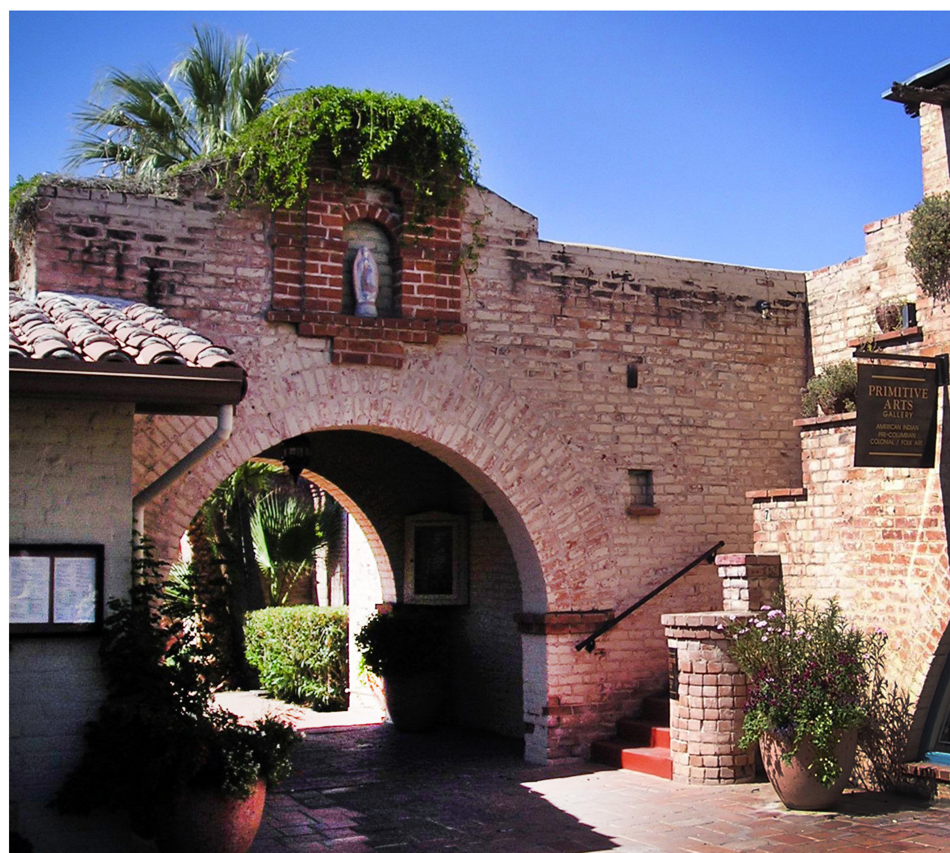
A passageway and staircase in Broadway Village, designed by Joesler & Murphey, built in 1939.