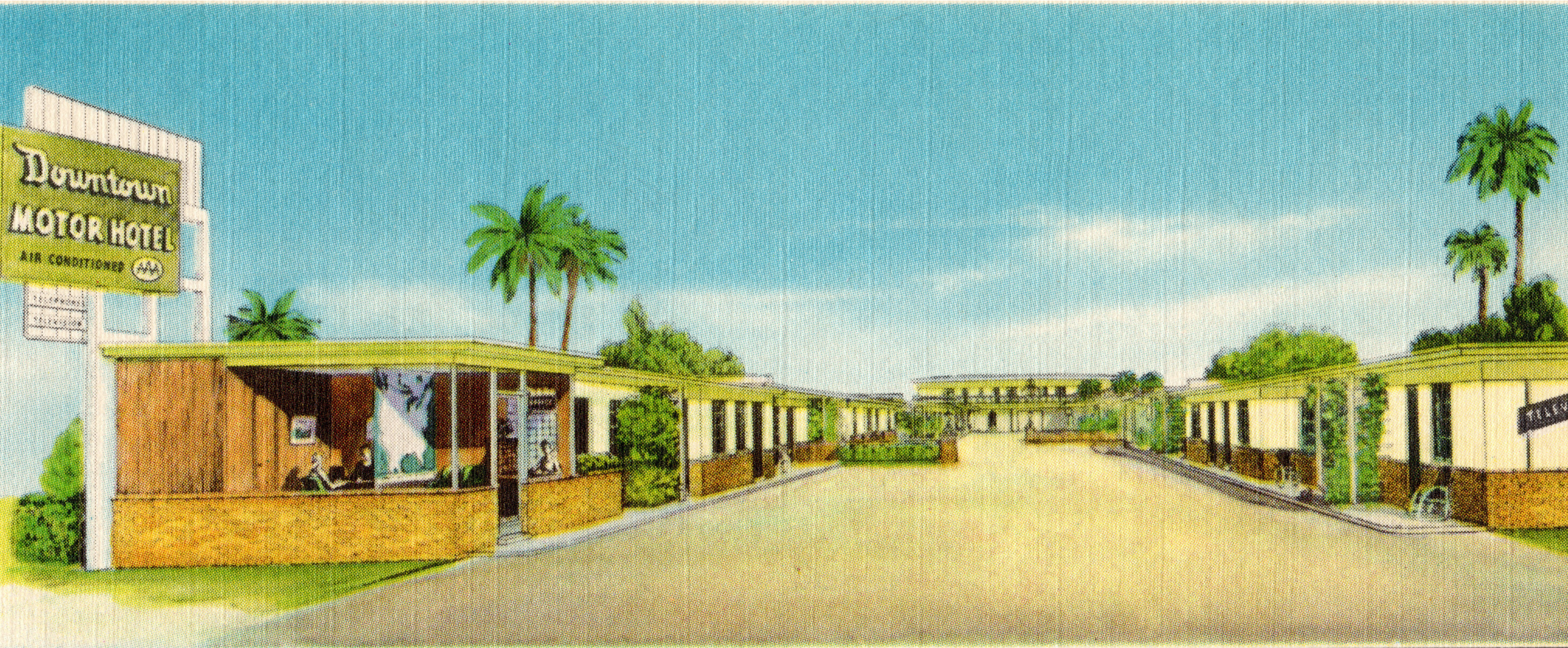
Vintage postcard showing the Downtown Motor Hotel.