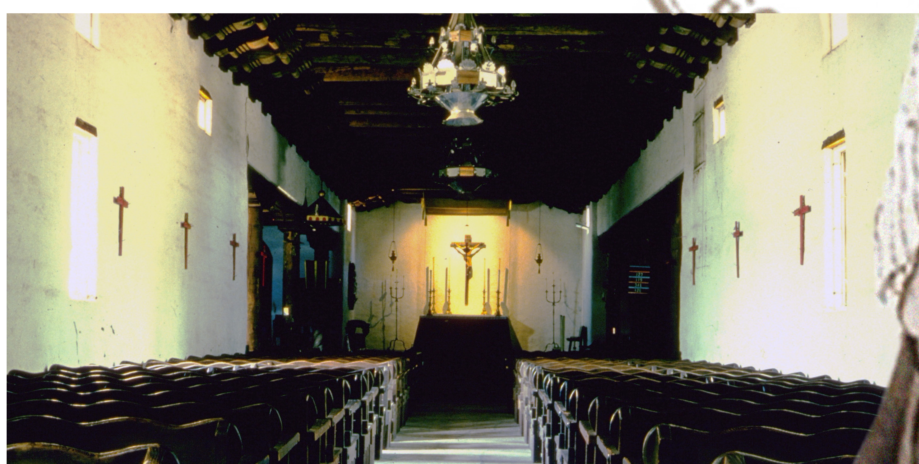
Nave, St Michael’s and All Angels Episcopal Church, 1953.