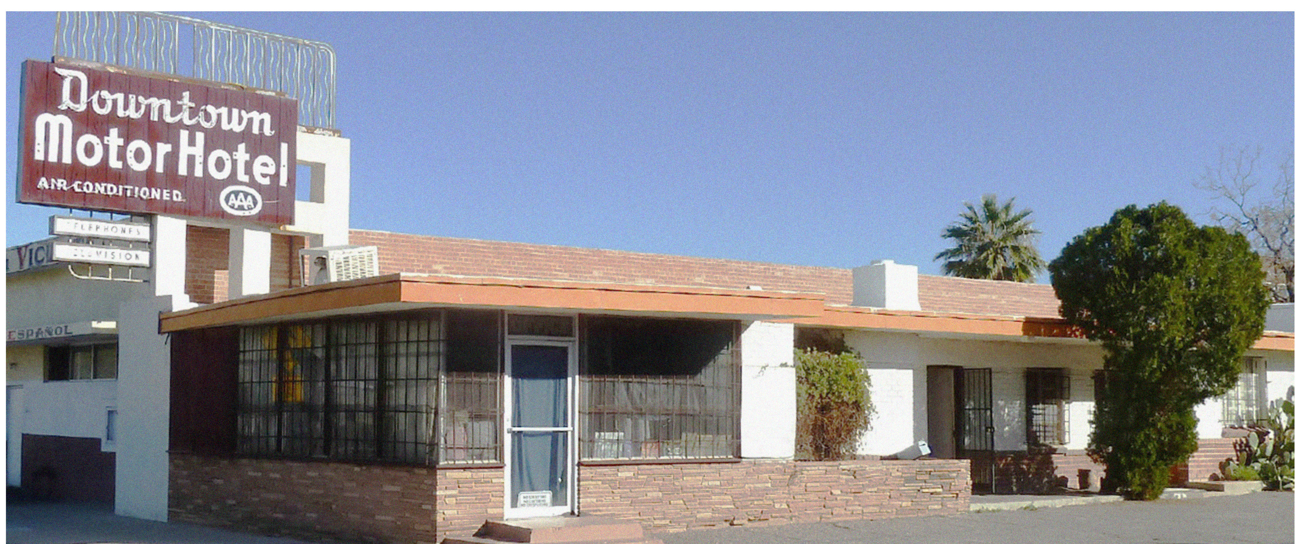
The iconic sign still stands, along with the street-front portion of the original hotel.