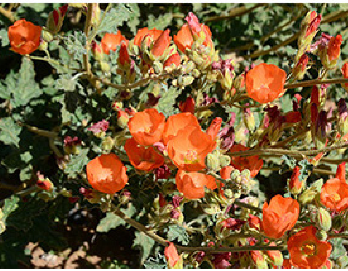
Globemallow Sphaeralcea ambigua