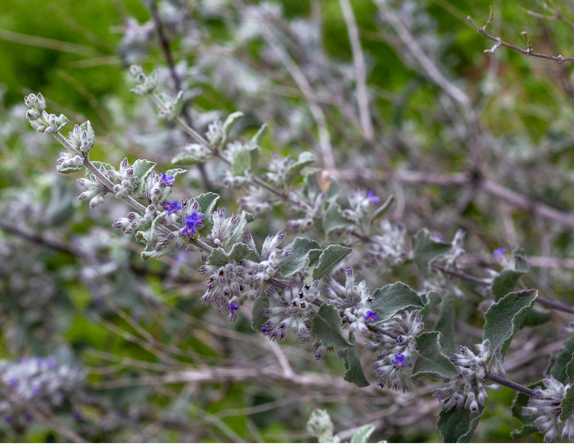
Desert Sage Salvia dorrii