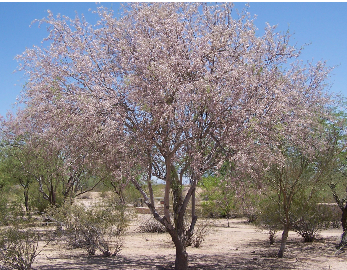
Ironwood Olneya tesota