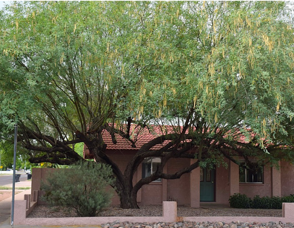
Mesquite Prosopis velutina