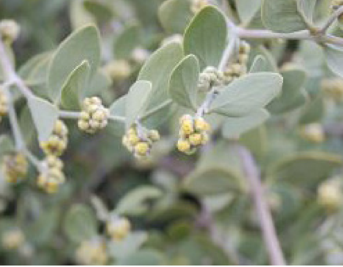
Jojoba Simmondsia chinensis