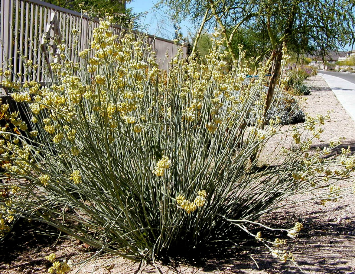
Desert Milkweed Asclepias subulata