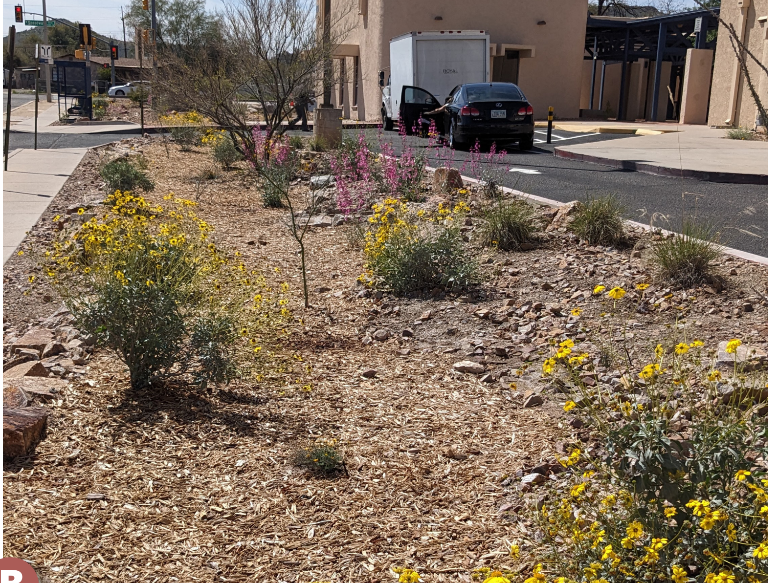
B Water harvesting basin with mulch and native pollinator plants