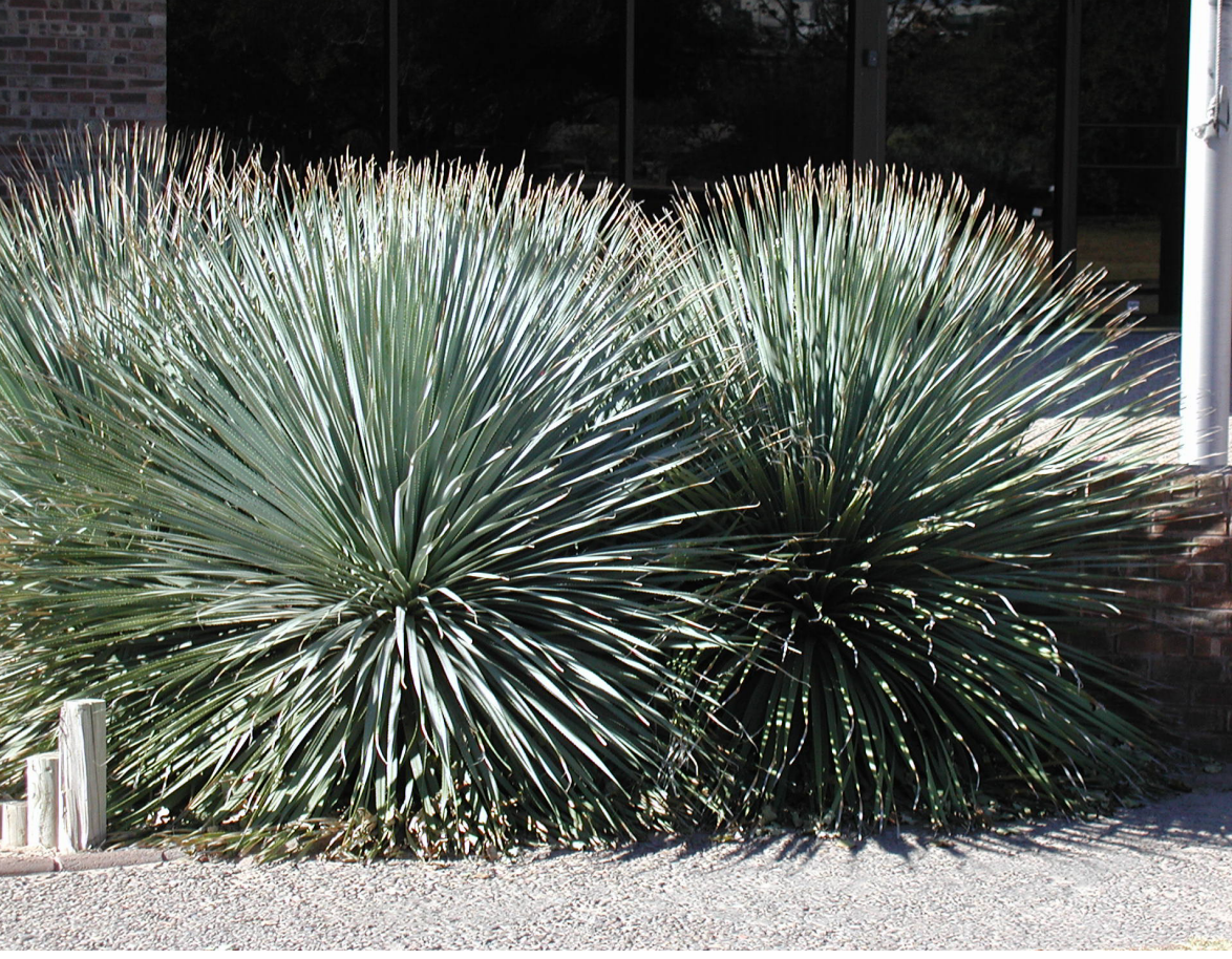
Desert Spoon Dasyilirion wheeleri