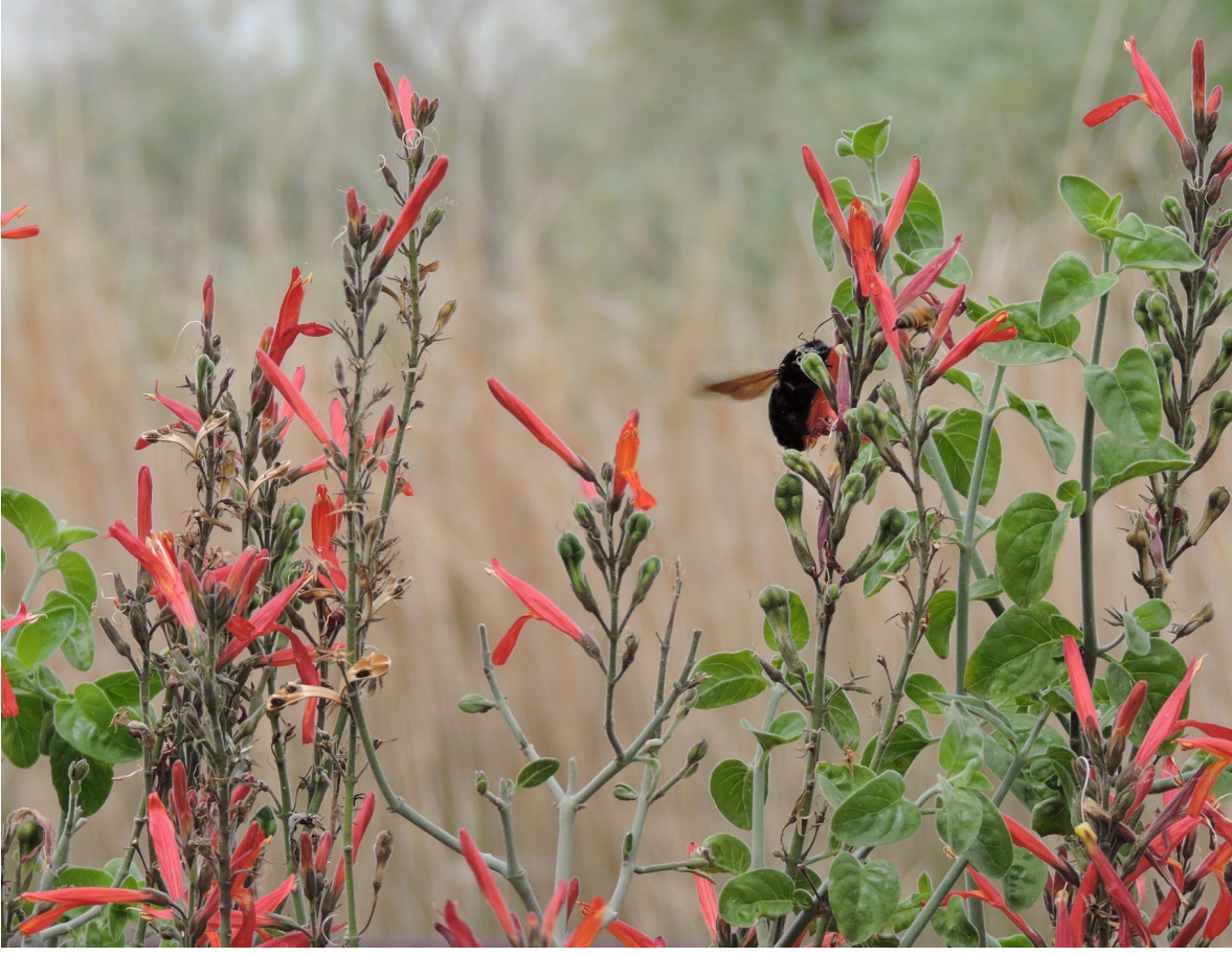
Desert Honeysuckle Anisacanthus thurberi