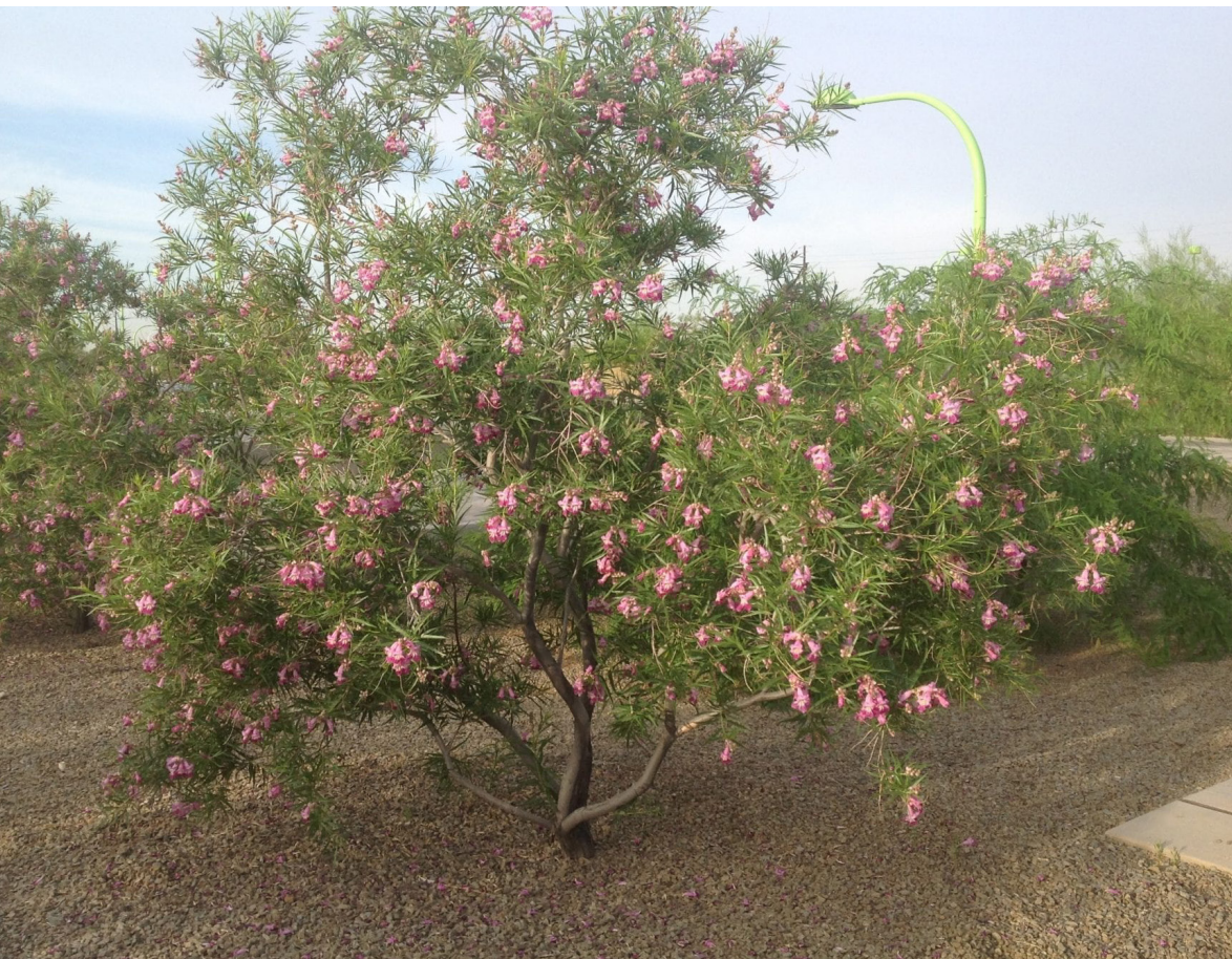
Desert Willow Chilopsis linearis