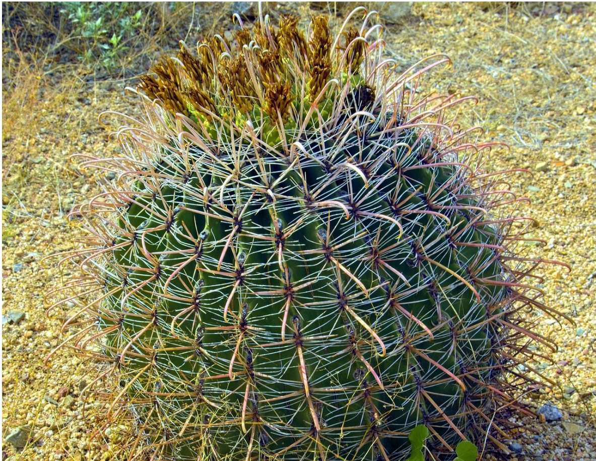
Barrel Cactus Ferocactus spp.