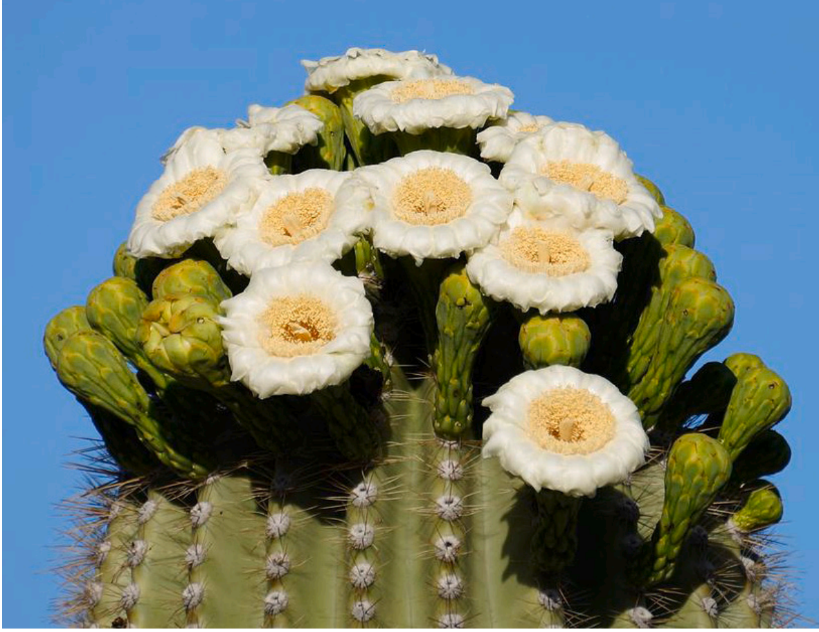
Saguaro Cactus Carnegiea gigantea