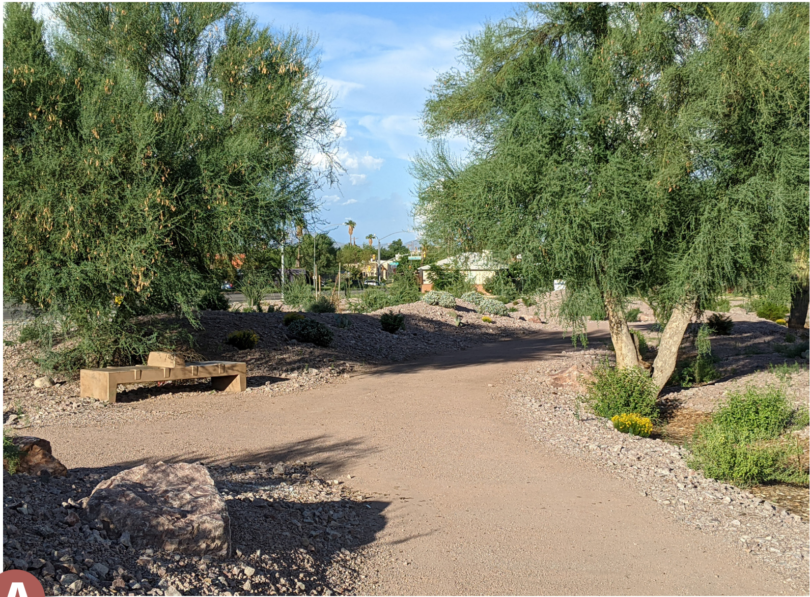
A Natural soil pathway between basins

The proposed park improvements respond directly to site-specific challenges identified through community feedback and collaboration with Parks and Recreation staff. Enhancements include the addition of a small steel shade ramada over an existing picnic table, passive rainwater harvesting basins featuring pollinator-friendly trees and shrubs, and the addition of woody mulch under all existing trees to improve tree health and reduce dust. Additional deep water irrigation to existing trees will further support the tree health. Natural walking pathways throughout the water harvesting area with native, pollinator-friendly plants will invite users to enjoy this well-loved neighborhood park.