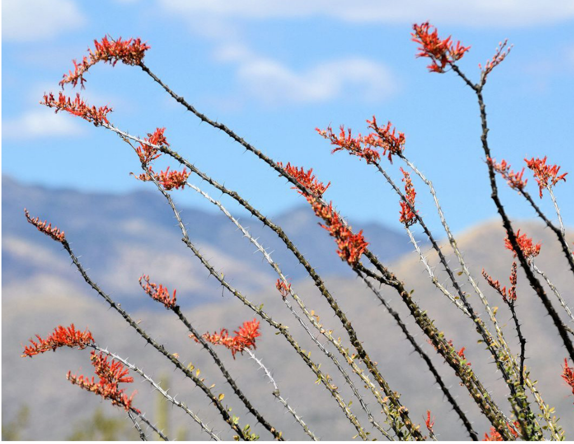
Ocotillo Fouquieria splendens