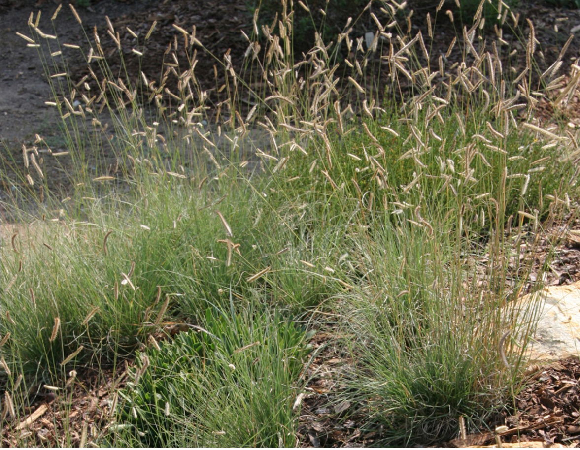
Grama Grass Bouteloua spp.