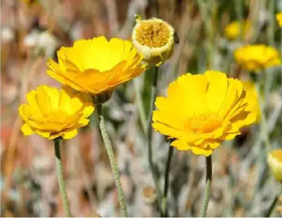
Desert Marigold Baileya multiradiata