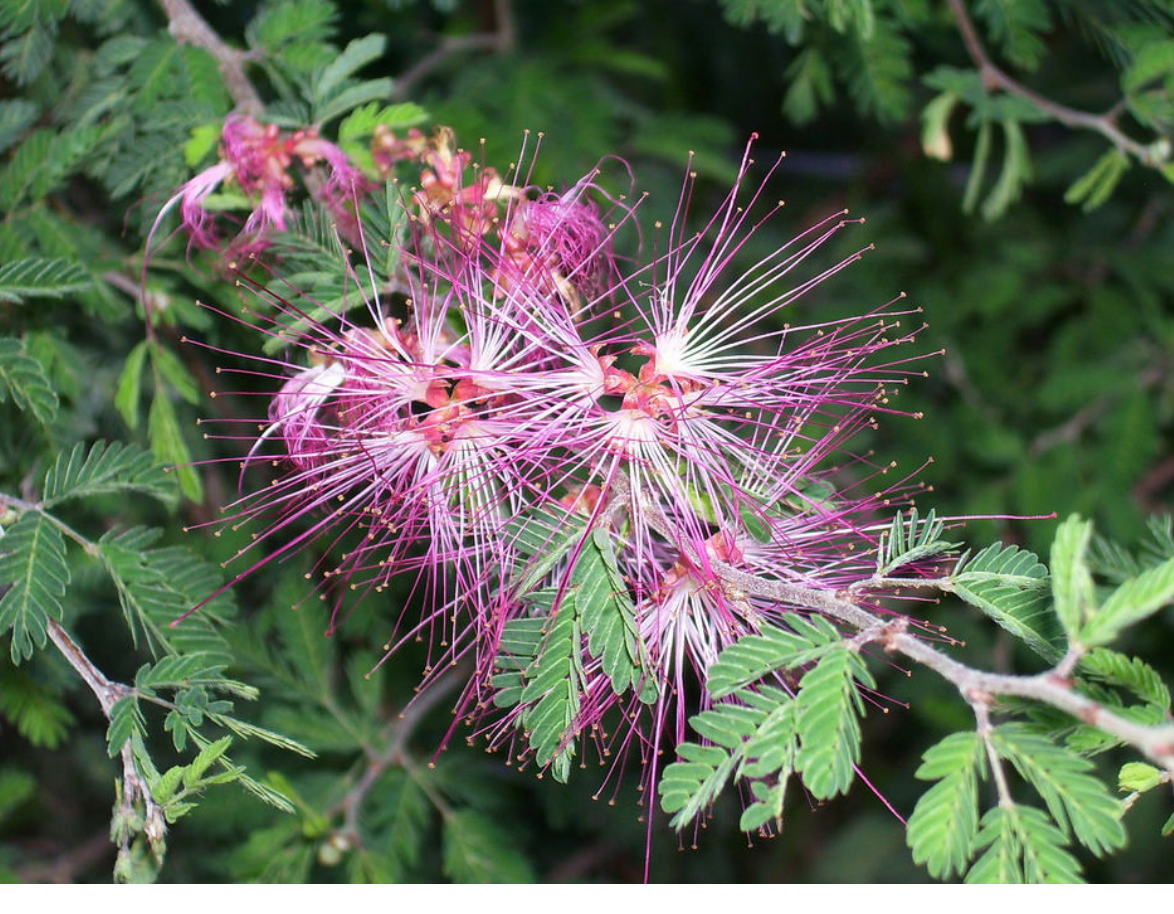
Fairy Duster Calliandra eriophylla