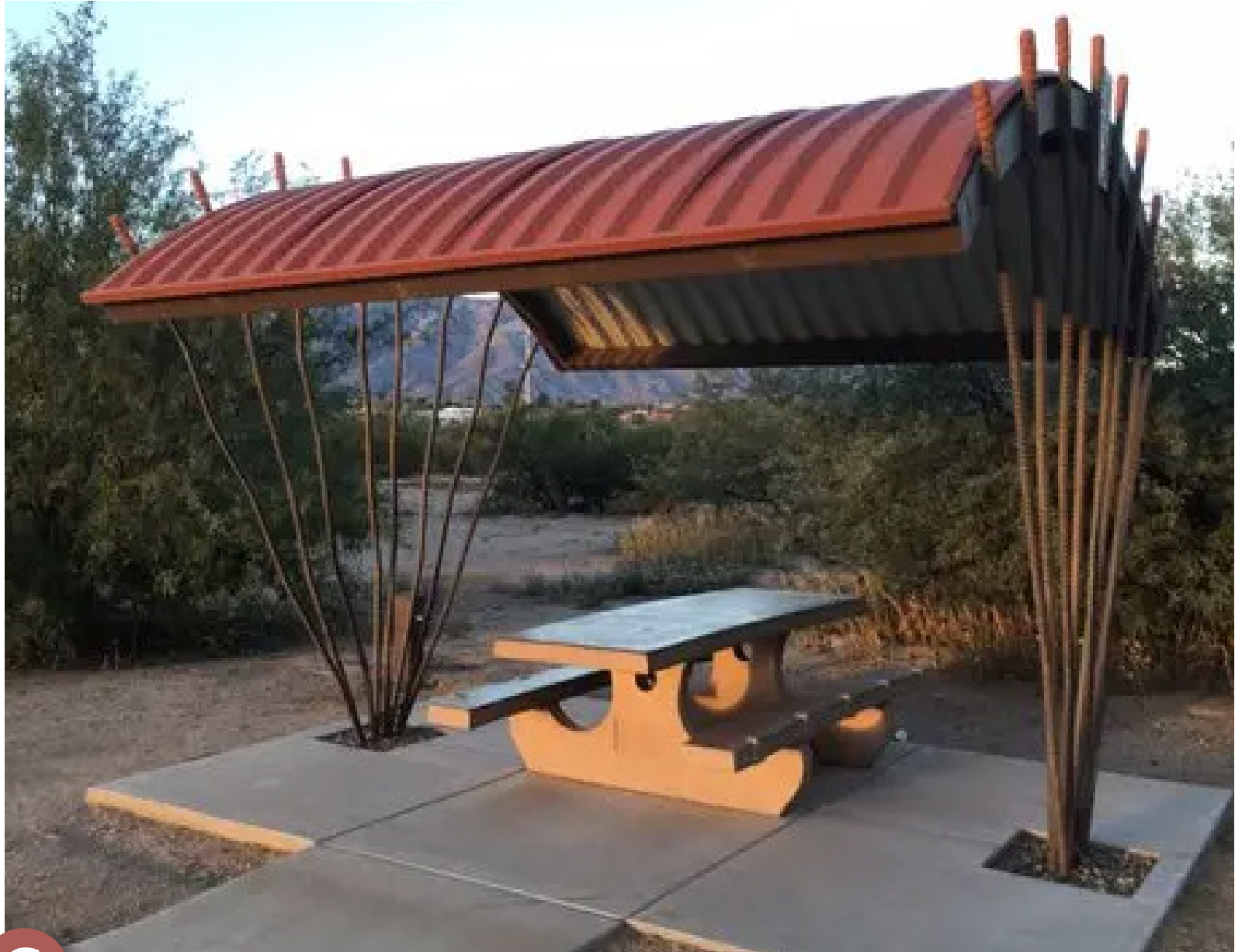
C Ocotillo ramada with red roof and rust accents