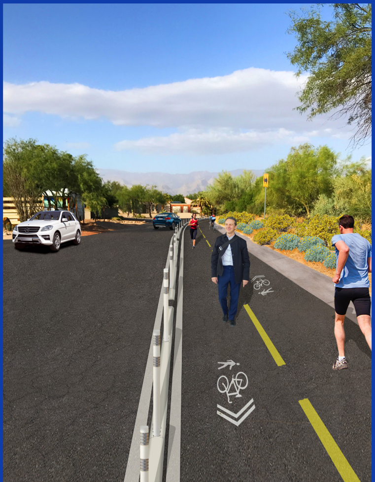
View Looking North Along 12' Paved Pathway Adjacent to Sarnoff Road