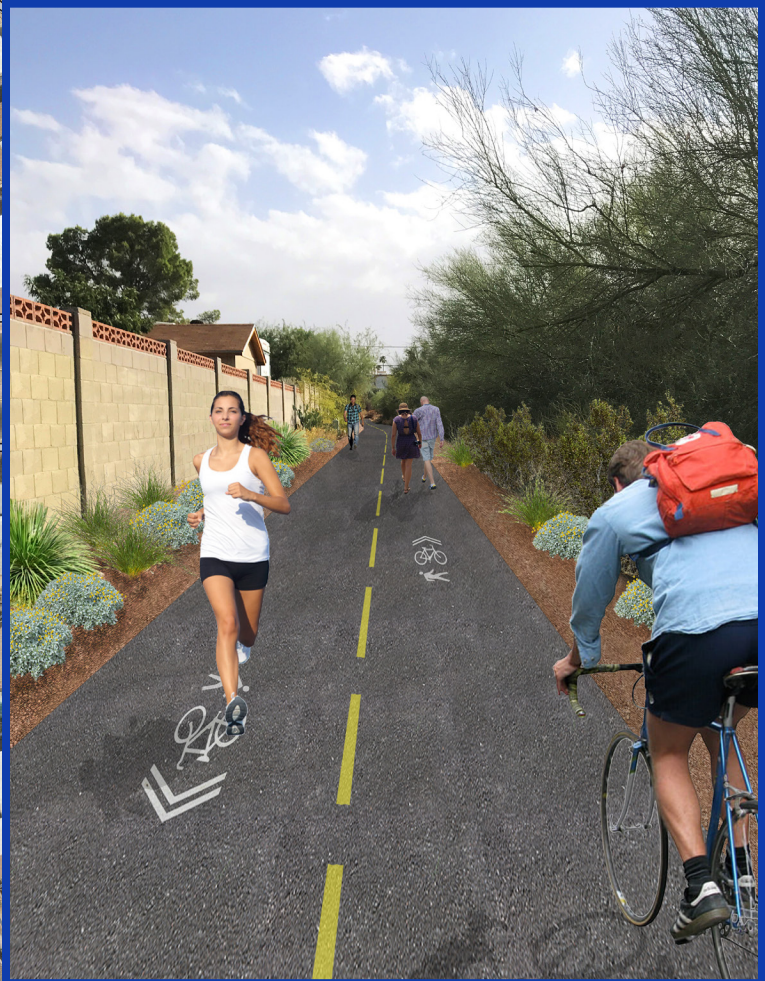
Typical View of 12' Paved Pathway Adjacent to Wash Corridor