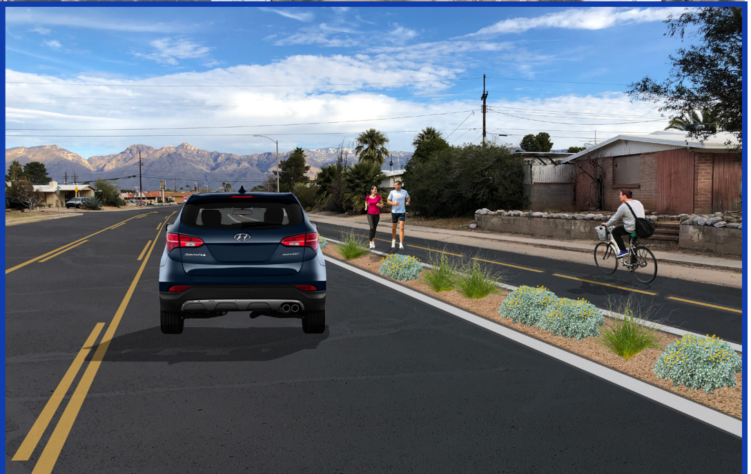
Proposed Road Diet Along Sarnoff Drive to Accomodate 12' Separated Pathway