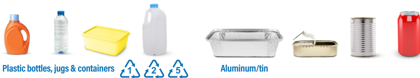
Plastic bottles, jugs & containers