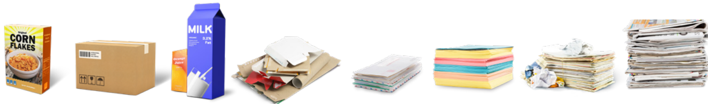
Cardboard (Please flatten)

YES! Recycle these items in the blue bin.