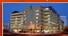
Pennington Street Garage Open 24 Hours Close to Stop 9