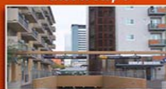
Depot Plaza Garage Open 24 Hours Close to Stop 8