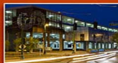
Centro Garage Open 24 Hours Close to Stop 8

when you park in a ParkWise Garage and ride the FREE GemRide shuttle.